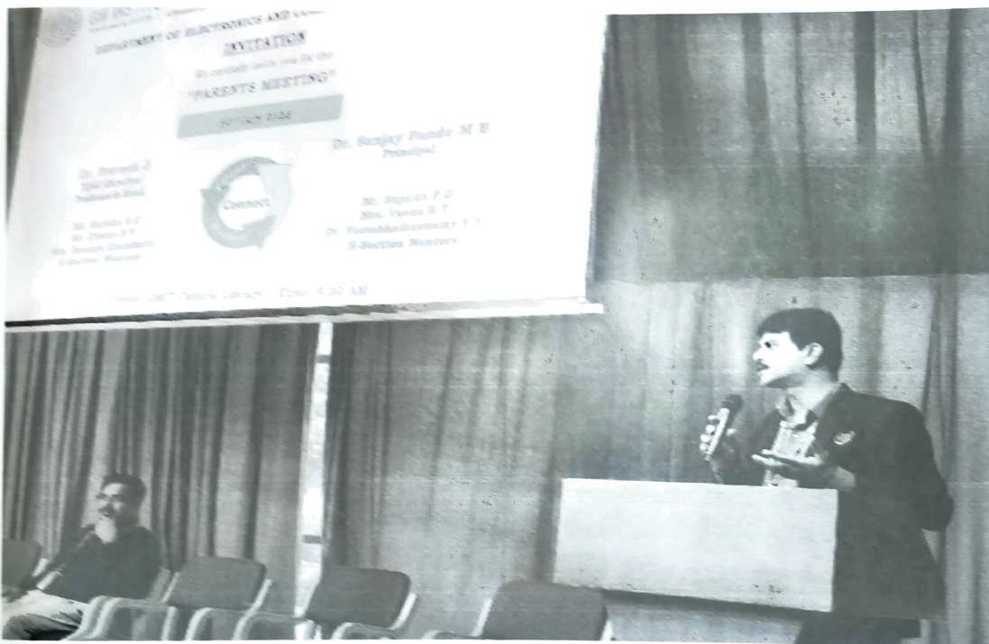
Photos taken during the Parents - Teacher Meeting