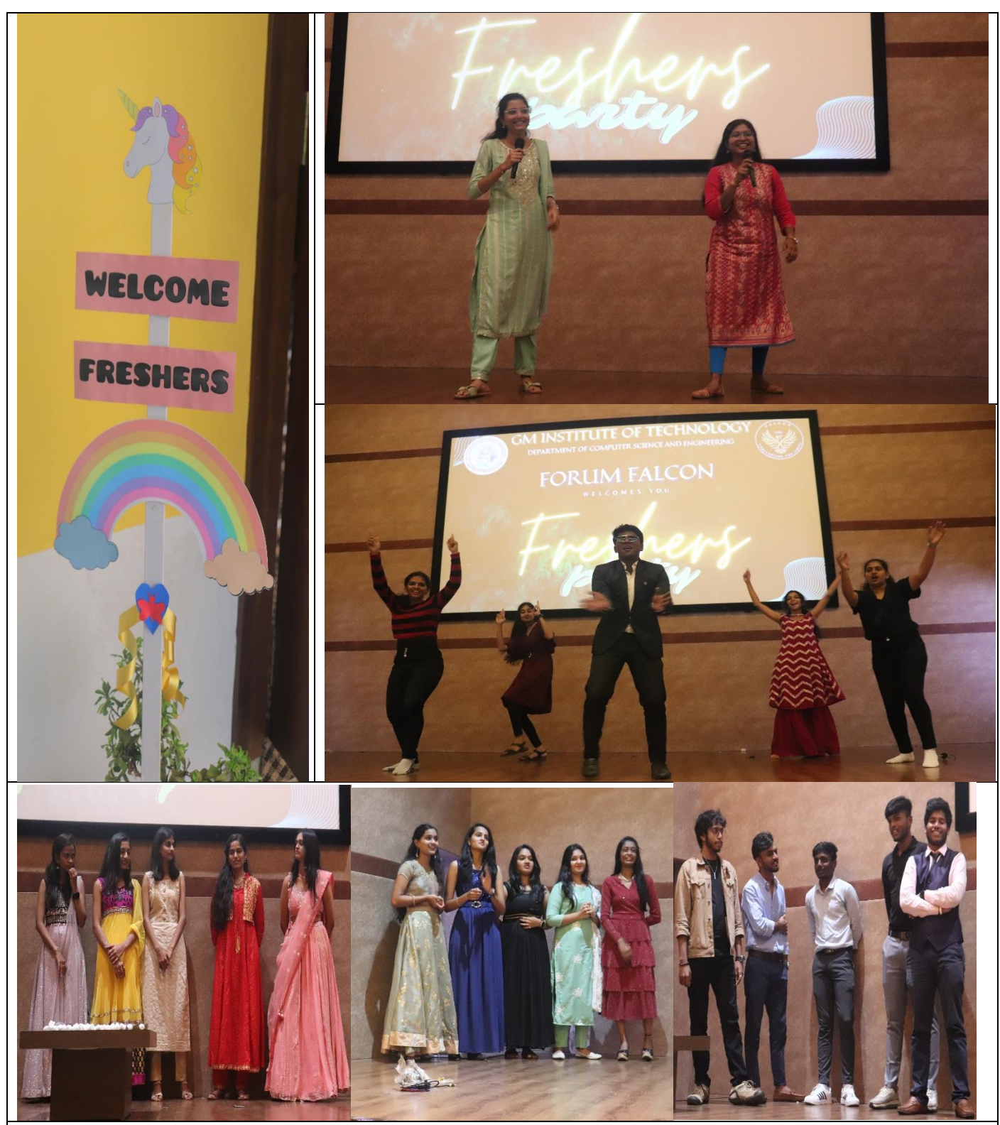
Department of Computer Science and Engineering students Celebrated Fresher's day.