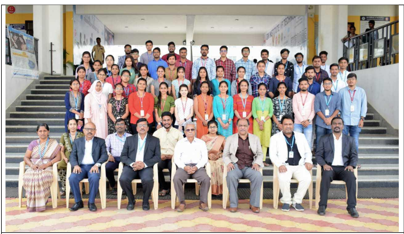
Congratulation for Computer Science and Engineering Students (Both 5<sup>th</sup> and 7<sup>th</sup> Sem), those who are selected to SLK Company on 2<sup>nd</sup> November 2022