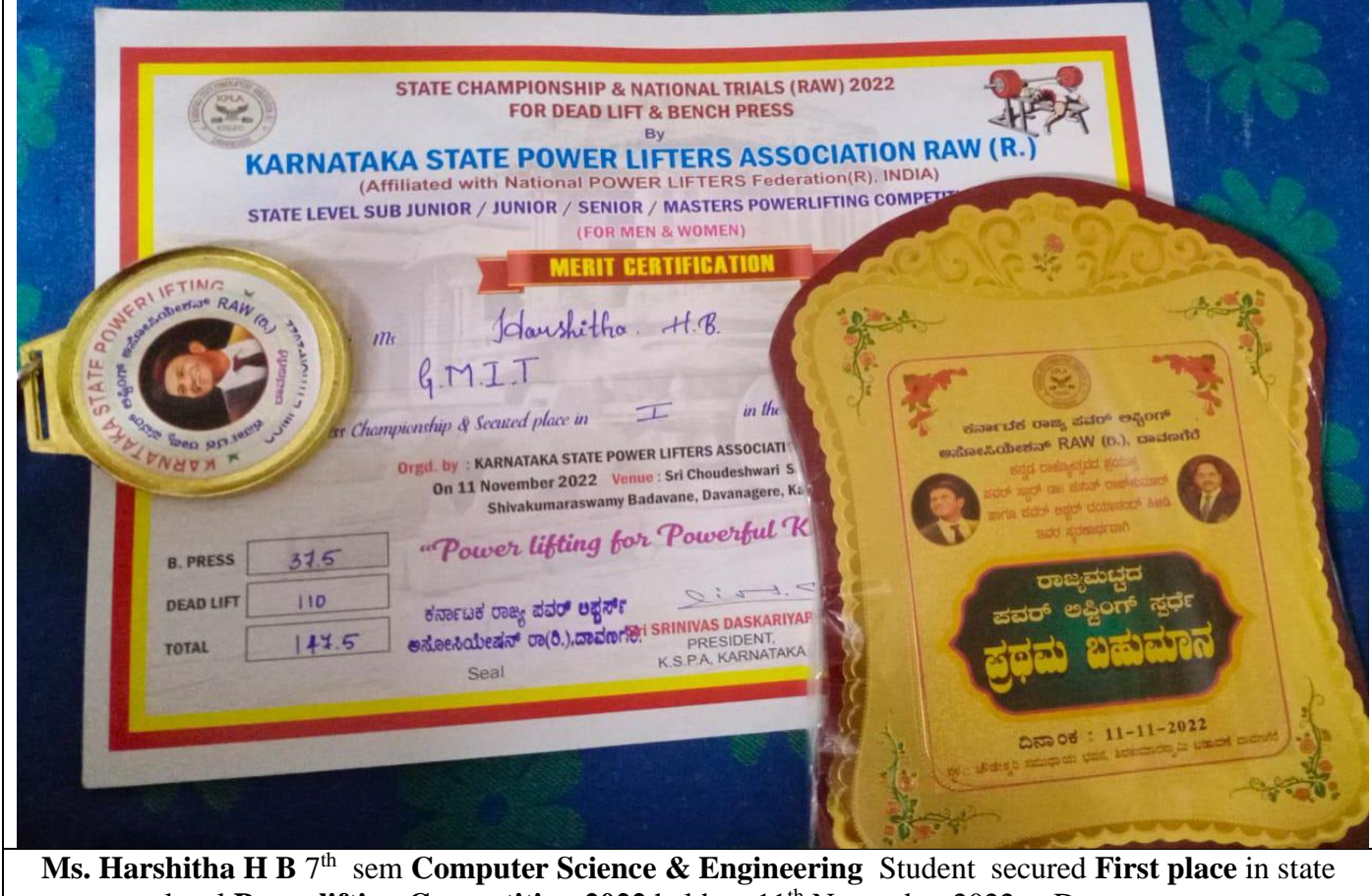
level Powerlifting Competition 2022 held on 11<sup>th</sup> November 2022 at Davanagere.