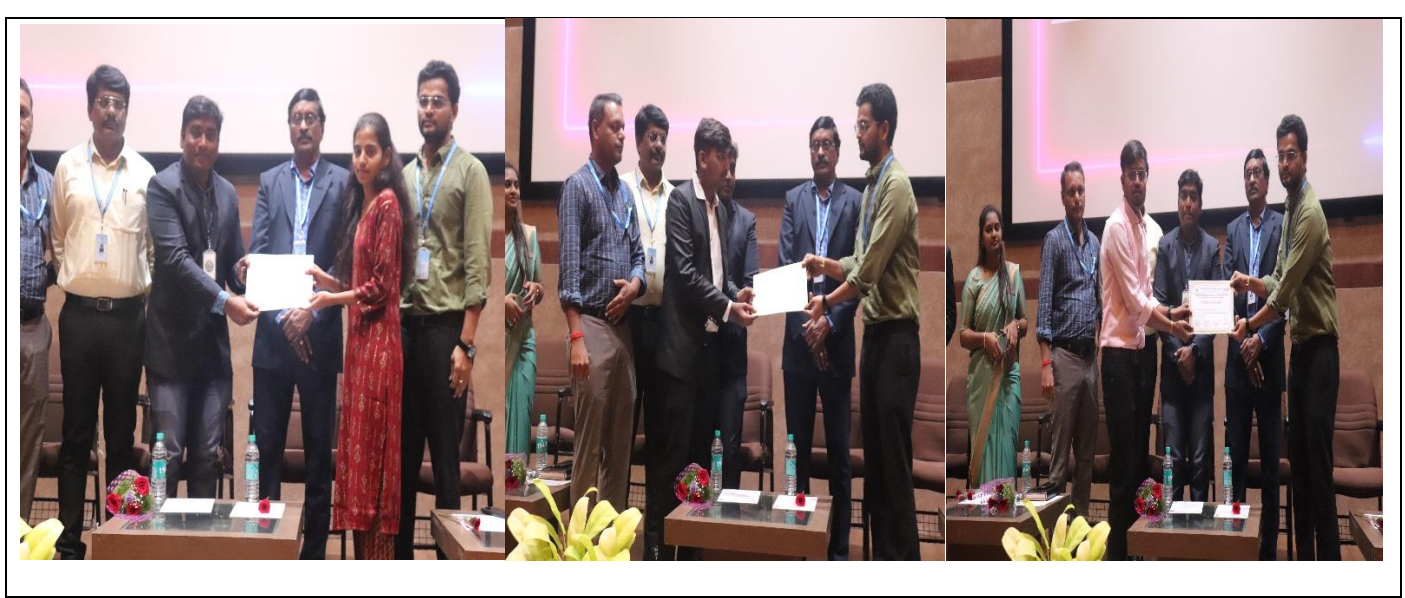
Workshop Prize Distribution