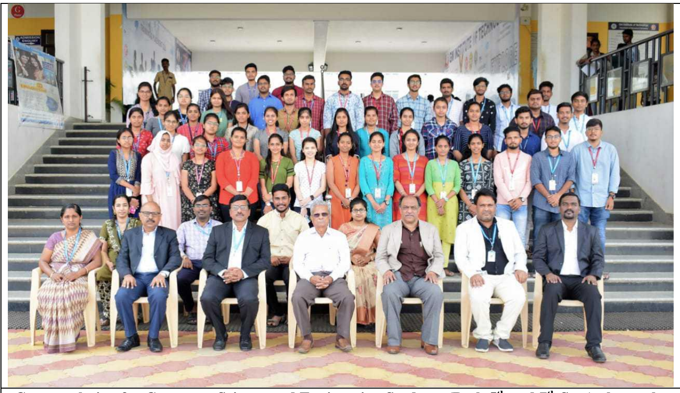
Congratulation for Computer Science and Engineering Students (Both 5<sup>th</sup> and 7<sup>th</sup> Sem), those who are selected to SLK Company on 2<sup>nd</sup> November 2022